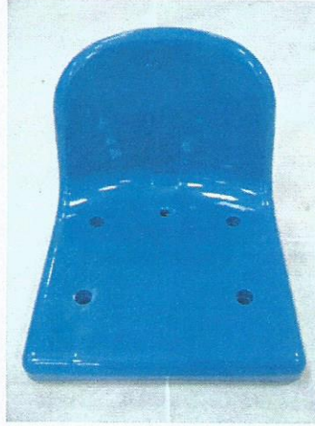
Figure1. Fixed Stadium Seat samples.

Fixed Seat samples (Figure 1) which produced by Yücel Bahçe Mobilyaları San. ve Tic. A.Ş. have been evaluated according to EN 13200-4 standart. Obtained results were given following: